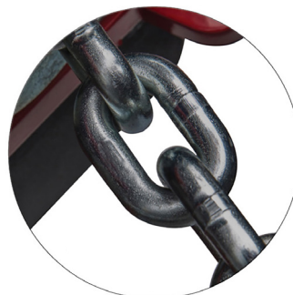
Custom load chain and pendant cable lengths available