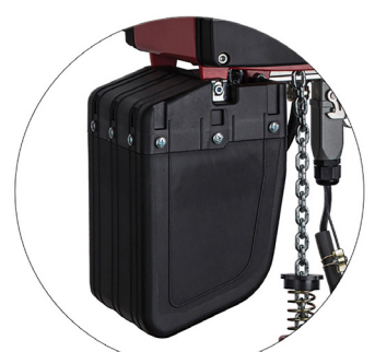
Larger capacity chain buckets available