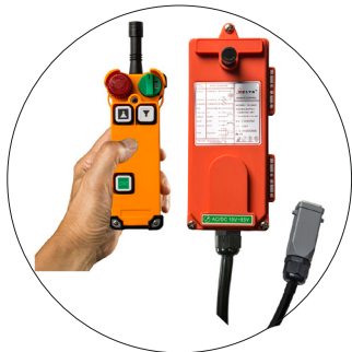
Remote Control Two button - Single Speed Easy Plug & Play Connection