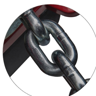
Custom load chain and pendant cable lengths available